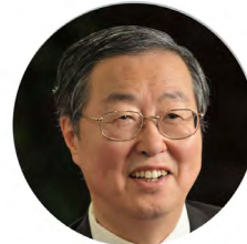
Dr. Zhou Xiaochuan China