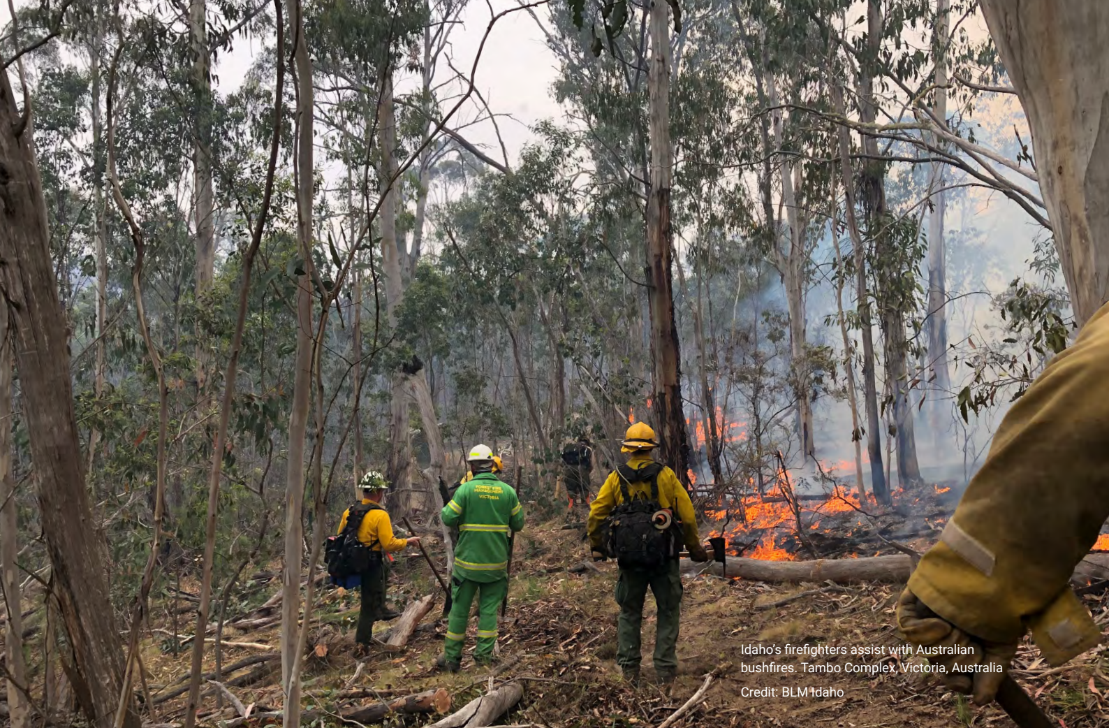
Idaho's firefighters assist with Australian bushfires. Tambo Complex, Victoria, Australia