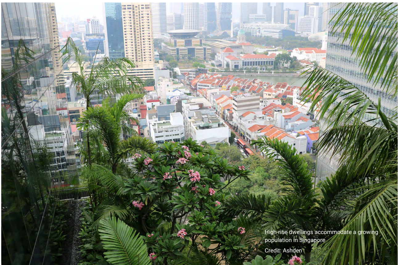
High-rise dwellings accommodate a growing population in Singapore