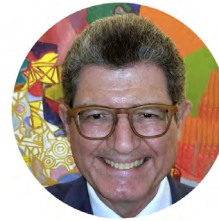
Mr. Joaquim Levy Brazil