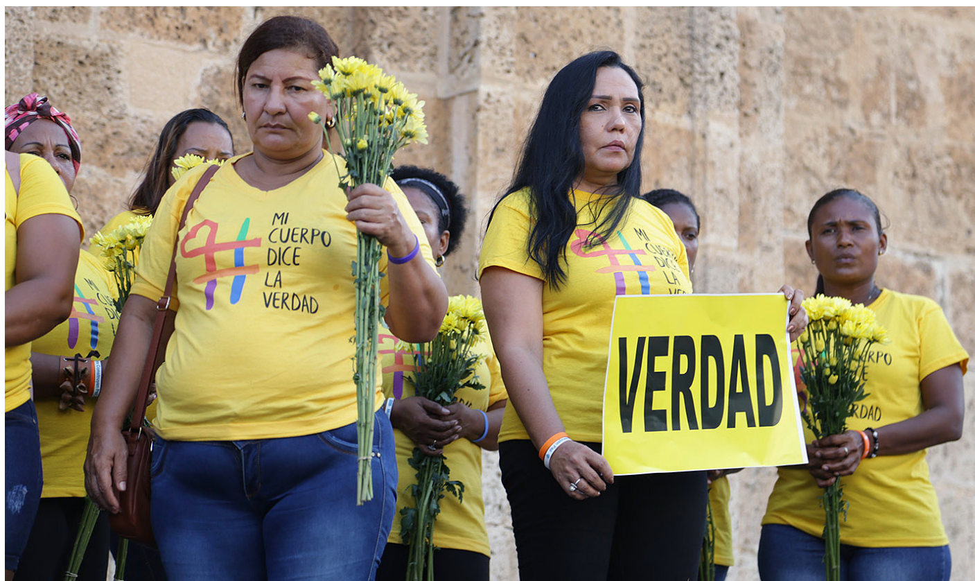
PBF-supported activities in Colombia — like this outreach effort related to the Truth Commission — helped advance justice while also strengthening the credibility of the peace process. Such projects illustrate the promise of combining human rights and peacebuilding approaches.

Given the broader finding that human rights perspectives and tools can complement and enhance conflict prevention and peacebuilding strategies, the Thematic Review identified a number of steps that PBSO, other UN entities, implementing partners, and other Member States or donors might take to enhance human rights and peacebuilding. Chief among these was investing in human rights capacities, both within the UN system, as well as within the countries in question. The strongest projects within the Review tended to be those that were developed by personnel with strong expertise in human rights and peacebuilding, which were then taken forward in partnership with local civil society and government actors who were vested in the human rights and peacebuilding outcomes in question. A large subset of the projects examined were focused on supporting government institutions to better respond to human rights concerns and their connection to conflict drivers. This proved to be a crucial strategy, especially when balanced by project components that supported rights-holders in calling for and advancing rights protection.