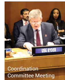
Coordination Committee Meeting

behalf of the Secretary-General, Mr. Guy Ryder, Under-Secretary-General for Policy called for greater efforts to address the conditions conducive to the spread of terrorism and enhanced coordination of UN CT efforts through the Compact to bring the bold vision of the Pact to life. (5-6 Feb)